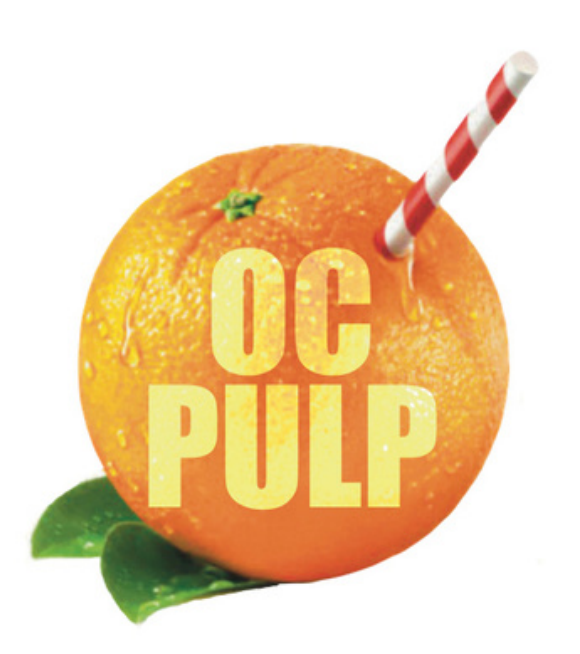
Come see OC Pulp at Sol Do!

We will be running a community crafting event for all ages to participate in tactile, creative fun!