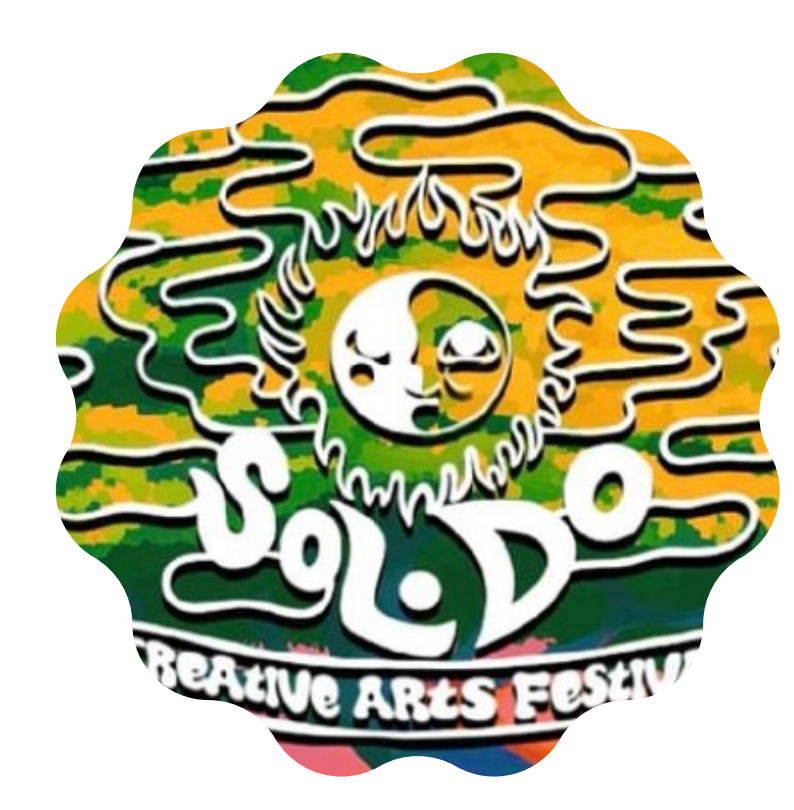
Enjoy local music, arts, foods, and nature!! FREE FOR ALL AGES!!