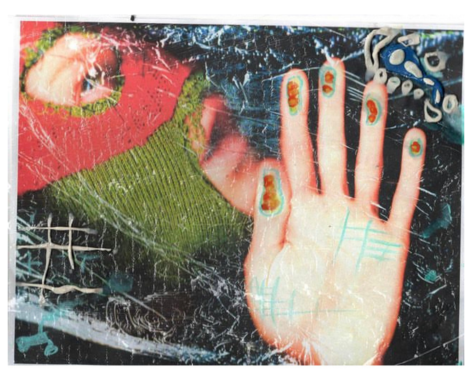
"Scangirl" Manipulated scanned image