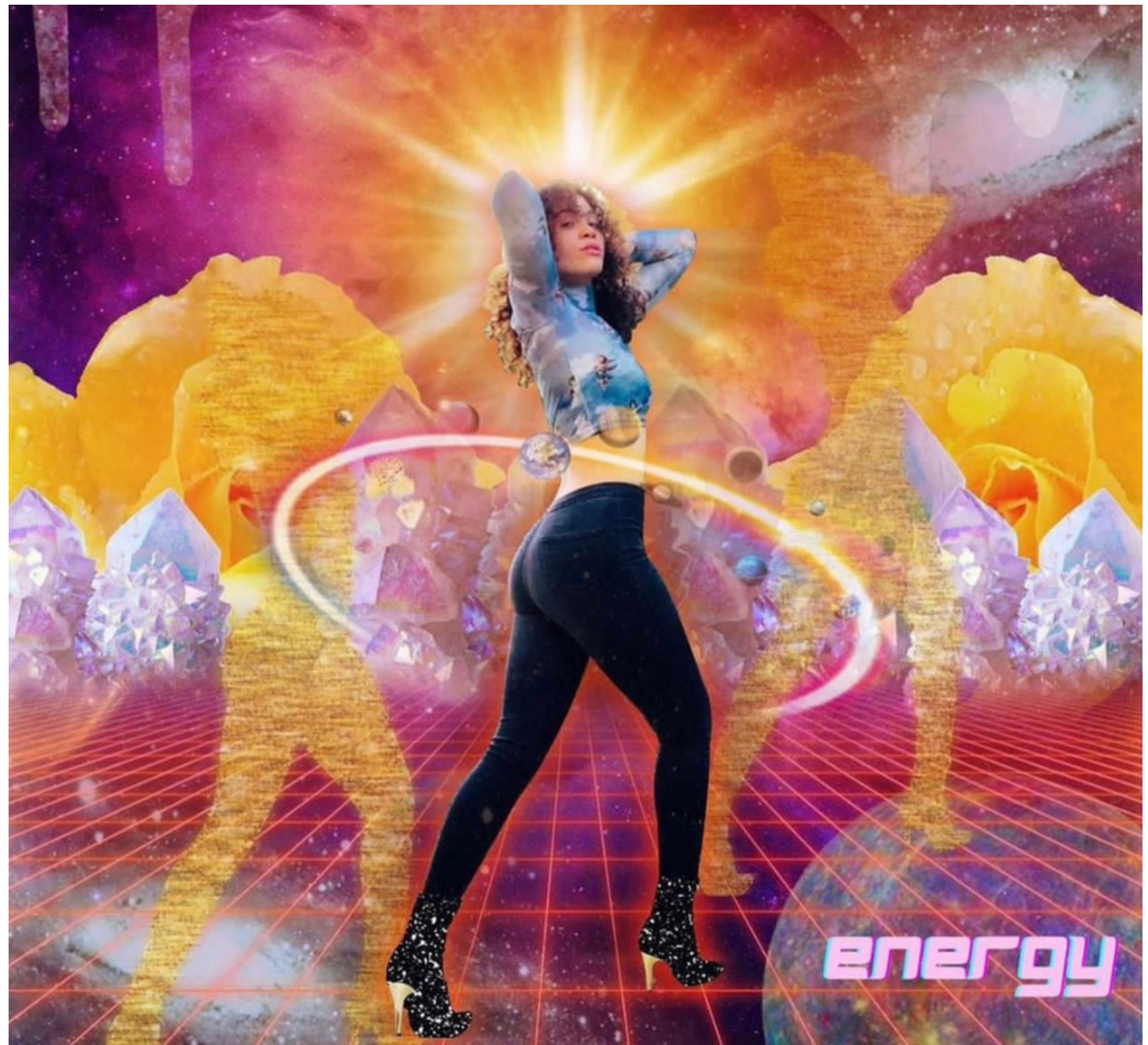
Cover for Anihasca's new single, "Energy," Available on bandcamp!

Moving through high school, Anihasca nurtured that inclination by joining a performance choir and broadening her musical horizons. "I'm very inspired by the '90s; A Tribe Called Quest, the stylings of Biggie Smalls, and Erykah Badu. I also love music that comes with a spiritual message or an authenticity. Freedom music! Jazz is a huge influence, because of its rawness."